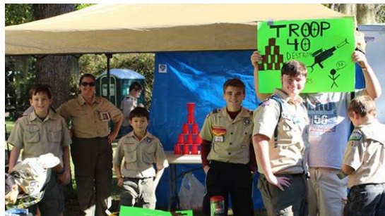
Some Troops hosted booths for campers to play games and get prizes