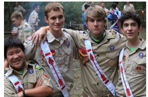
These Arrowmen are happy to be newly inducted Brotherhood members