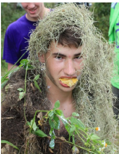
The Saturiwa Chief is actually an ape