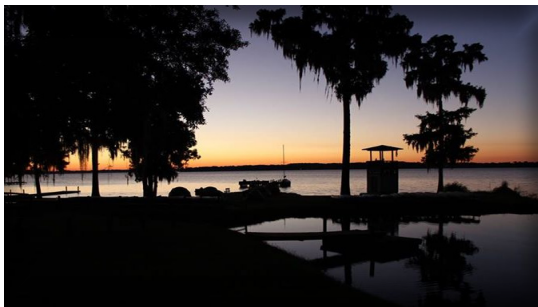
A beautiful sunrise overlooks the St. Johns River on Saturday morning at SNC

As most of you may know, the weekend of October 17-19 was Special Needs Camporee. I asked you guys if you could come cheerfully serve and you guys showed me outstanding attendance. Each chapter had a job and a booth at this event and each chapter executed it splendidly. Friday night, Echockotee Lodge assisted SNC staff with putting up tent city. On Saturday, we all went to work and we made campers enjoy one of the best times of their life. That same night, Echockotee Lodge hosted a campfire full of skits and songs. On Sunday morning, no one left until the work was done. We broke down tent city and picked up trash around the camp. Personally, I would like to thank everyone who came out and helped; this weekend wouldn't have strived as well without you guys.