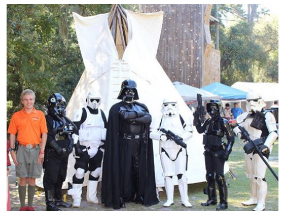
The Chief poses with some guests at SNC