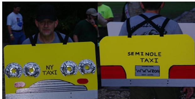
The Seminole Chapter got around during Fall Fellowship in their bright yellow New York Taxis