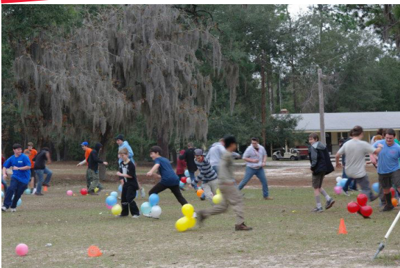
Arrowmen enjoying a game of balloon stomp