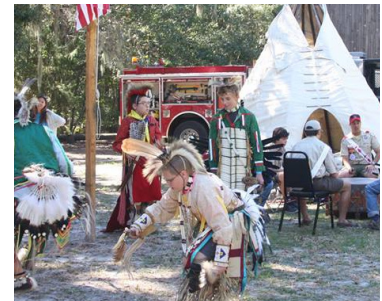
Our AIA dancers showing off some moves!