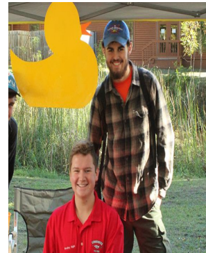
Lodge members having fun manning their booths.