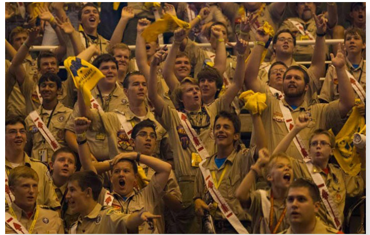
(above and below) The Echockotee Lodge contingent had an awesome time at the 2012 NOAC.

the Echockotee Lodge contingent (which includes several "side trips" along the way up to MSU), the cost will be about $1000. There is nearly a year until the conference, so start saving now! Echockotee Lodge offers scholarships to those in need. Registration has already opened, and you can hold your spot by paying in smaller amounts now, if you can't pay all at once. I will be there! I hope to see you having the time of your life at NOAC 2015!